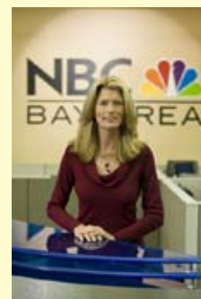
Diane Dwyer NBC Bay Area Weekend News Anchor

Guest Speaker: Diane Dwyer See Page 1 for details