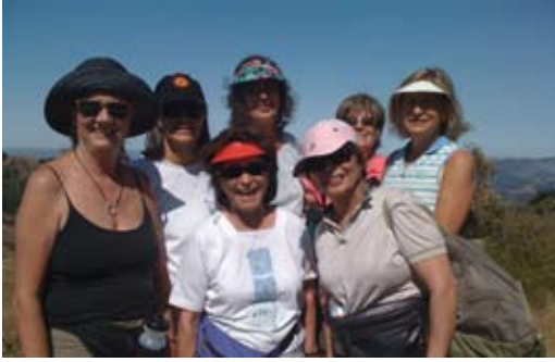
Hiking Group at Las Trampas, Summer, 2009