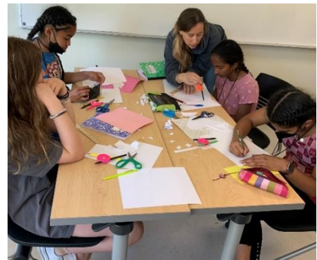
Sonoma campers in action