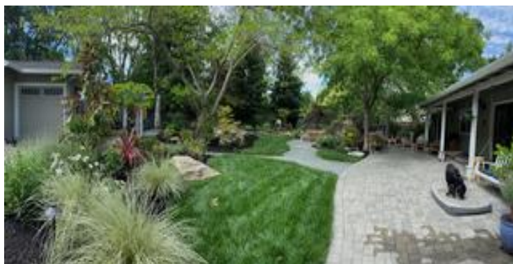
Nature's Sanctuary, 2023 DAW AAUW Garden Tour

Preparations are proceeding for the 21 st DAW Garden Tour. With a theme of Gardens that Inspire the tour committee has selected five spectacular local gardens for members and guests to visit on Friday and Saturday, May 12 and 13, 2023 from 10 am to 4 pm. Each garden is unique in its appeal and approach to creating beautiful and inviting home garden space. Tickets are available for $40.00 per person; all proceeds from the tour will go directly to our branch's local scholarships program. Registrants will receive a link to an online ticket and Garden Tour guide as the tour date approaches.