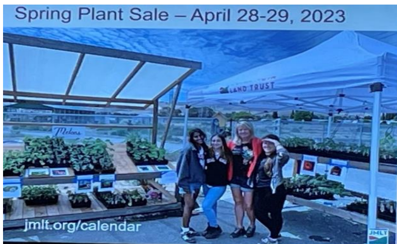
Coming event at the Family Harvest Farm