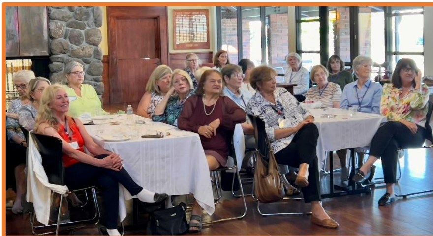
Here are some photos from the evening's event.