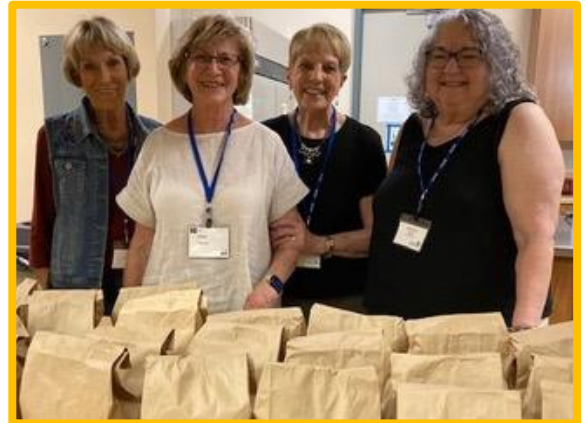
The Hospitality Team