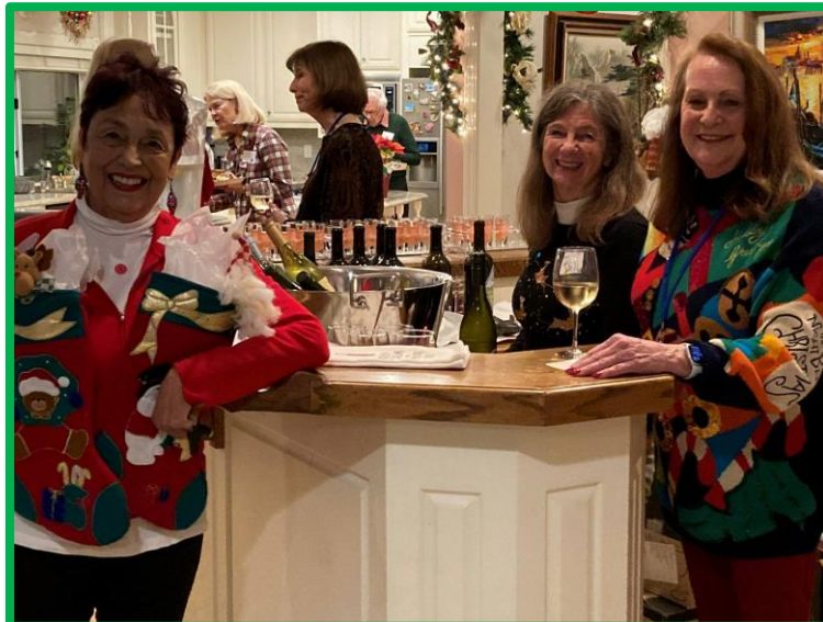
Scenes from the holiday party