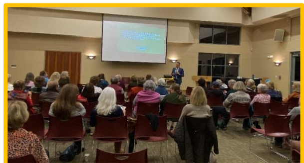
January Meeting Attendees

AB 1394 requires a court to award statutory damages between $1 million and $4 million for each act of commercial sexual exploitation that social media platforms “ knowingly facilitated, aided or abetted. ” Never before have social media mega-companies been held accountable for the impact of their products. It was great news and a positive way to end a lively and thought-provoking evening.