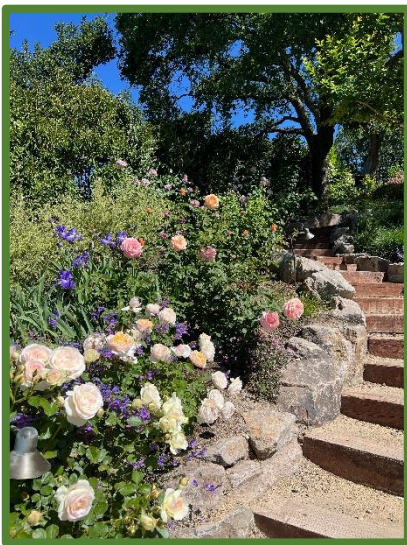
Some of the many roses at El Pintado

their gardens in top shape and share them for the tour. Carol Highton and