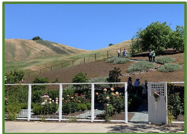
The entrancing view at Viking Place