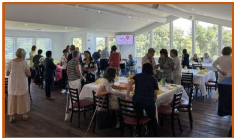
Brunch 2024 attendees