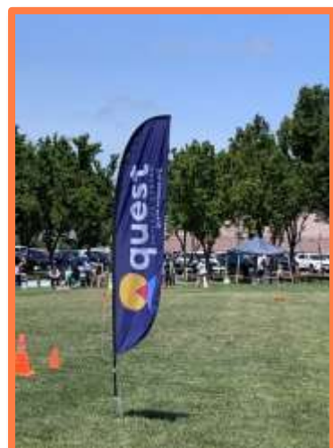
View from the rocket range at the Art & Wind Fest

This immersive, family-friendly activity attracted hundreds of participants throughout the day. Great fun was had by all, rocketeers and volunteers alike. With the resounding success of its Art & Wind Festival debut, Quest plans to return next year. We had a blast (no pun intended) and encourage DAW members to volunteer at future Quest events as information is shared with the branch. No STEM experience is needed to volunteer, just an interest in science and in helping people to experiment and learn.