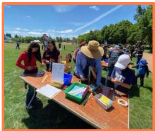
Festival visitors building their rockets

Festival organizers were thrilled with Quest's participation and provided them a large field to set up a hands-on activity with air-powered paper rockets. Assisted by enthusiastic volunteers, festival goers of all ages constructed paper rockets and tested their designs by shooting them skyward with air-powered rocket launchers. Rockets soared, many going an impressive distance, all to the cheers of rocketeers. Some flubbed and some didn't go far, so rocketeers went back to refine their designs and try again.