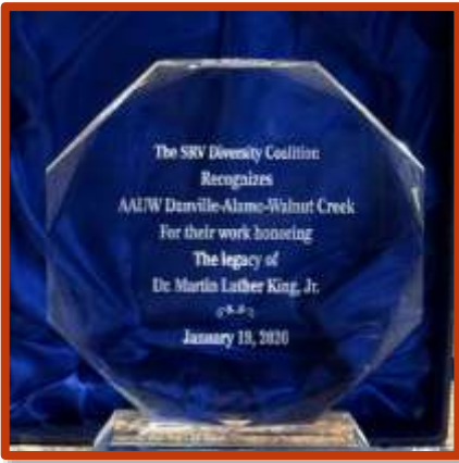
The commemorative plaque

Congratulatory message from the local PFLAG Chapter President: